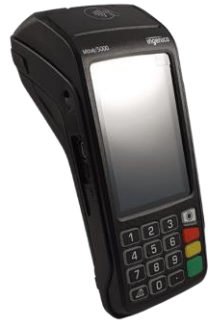
Ingenico Move 5000