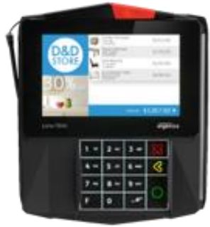
Ingenico Lane 7000