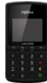
Ingenico Link 2500