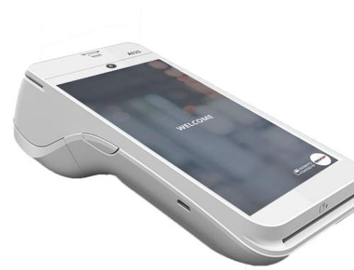
PAX A920 PRO