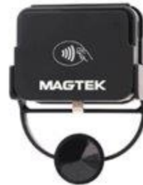
Magtek iDynamo 6