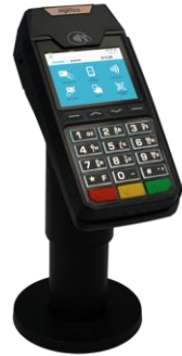
Ingenico Lane 3600